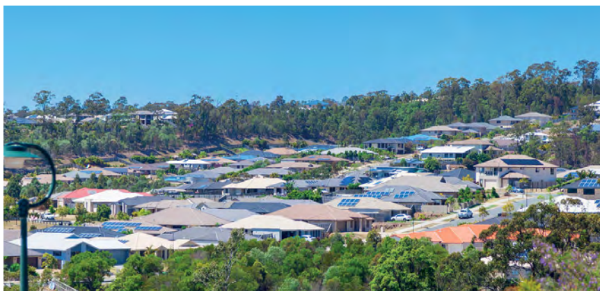
Distributed generation: rooftop solar panels in Australian suburbs

Innovative technology investments in this sector require patient capital, with the possi-