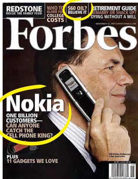
Forbes November 2007 front page

three-stage transformation to obtain electricity from fossil fuels: chemical energy into heat, heat into mechanical energy and mechanical energy into electricity; clearly a complex, costly and inherently inefficient process. Research around electricity focused mainly onto establishing a network and thus to bridge its disadvantages. As a result of all these drawbacks, the adoption of electricity grew at a lower rate than fossil fuels and electricity turned into a laggard. Its usage expanded alongside grid construction, but it was limited to applications requiring small amounts of energy such as lighting and domestic appliances.