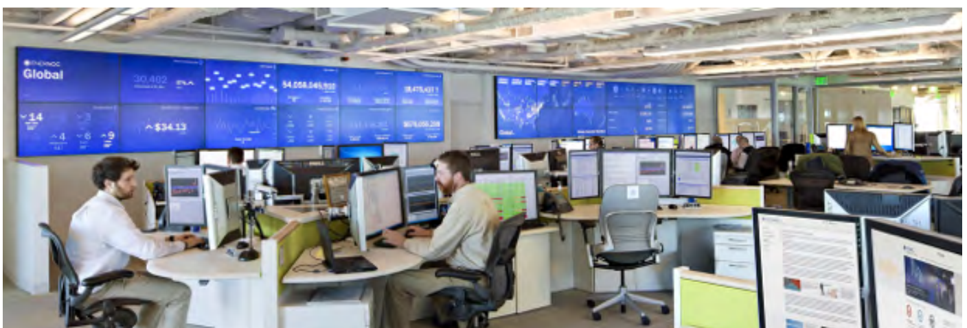
EnerNOC control room